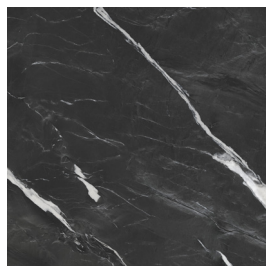
Italia Montblack Matt 600x600mm