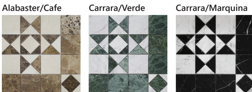
Milan Border 130x330mm