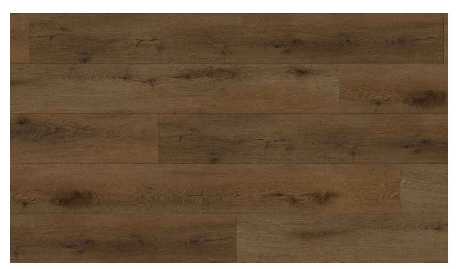
Max Floor Madera Teak 225x1800mm