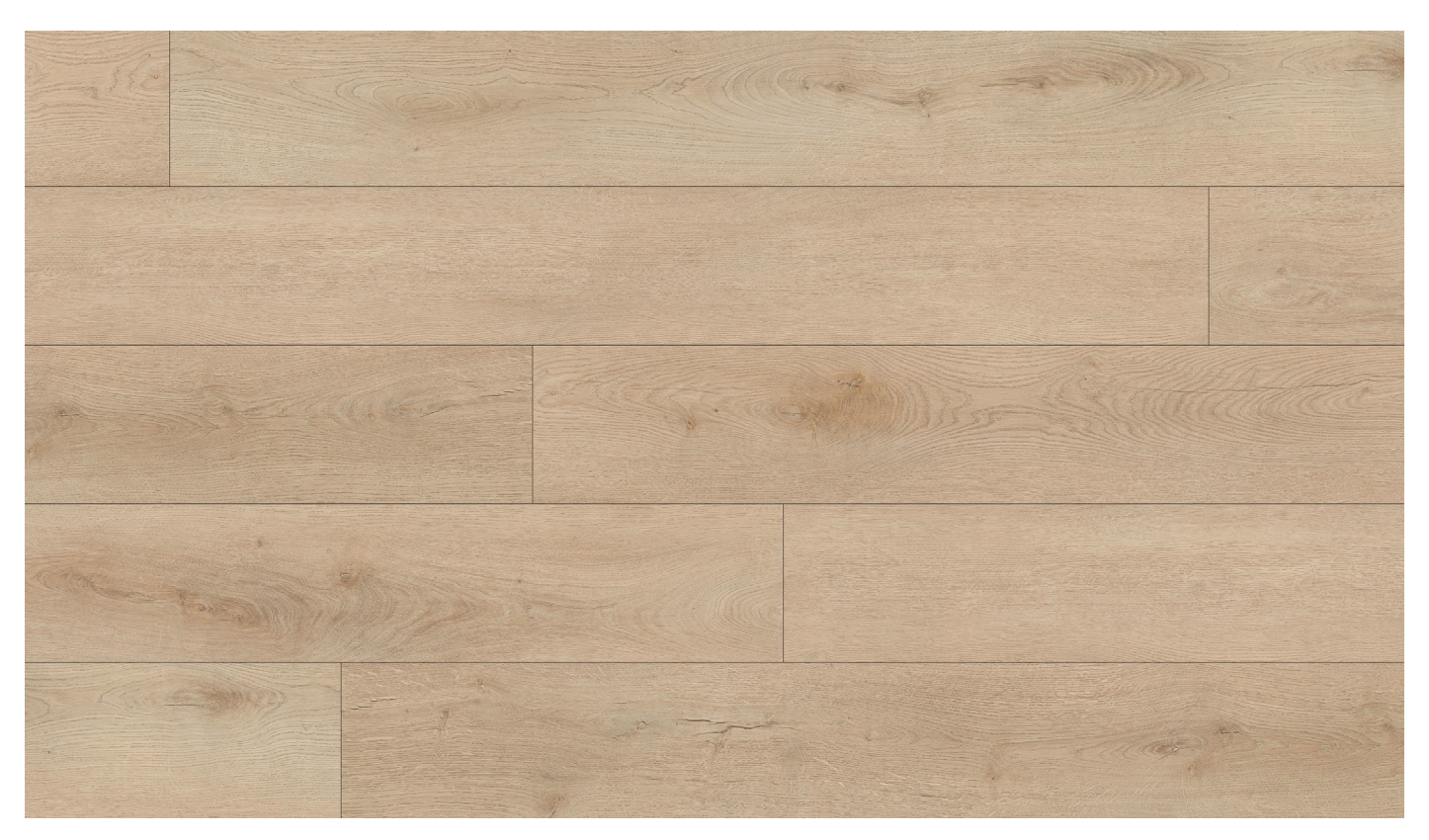
Max Floor Madera Poplar 225x1800mm