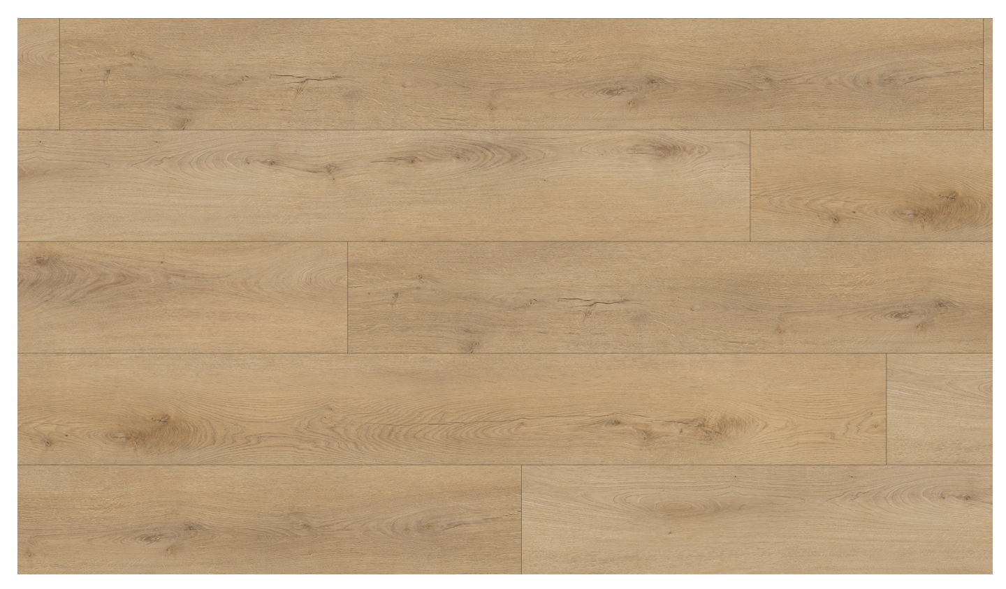
Max Floor Madera Alder 225x1800mm