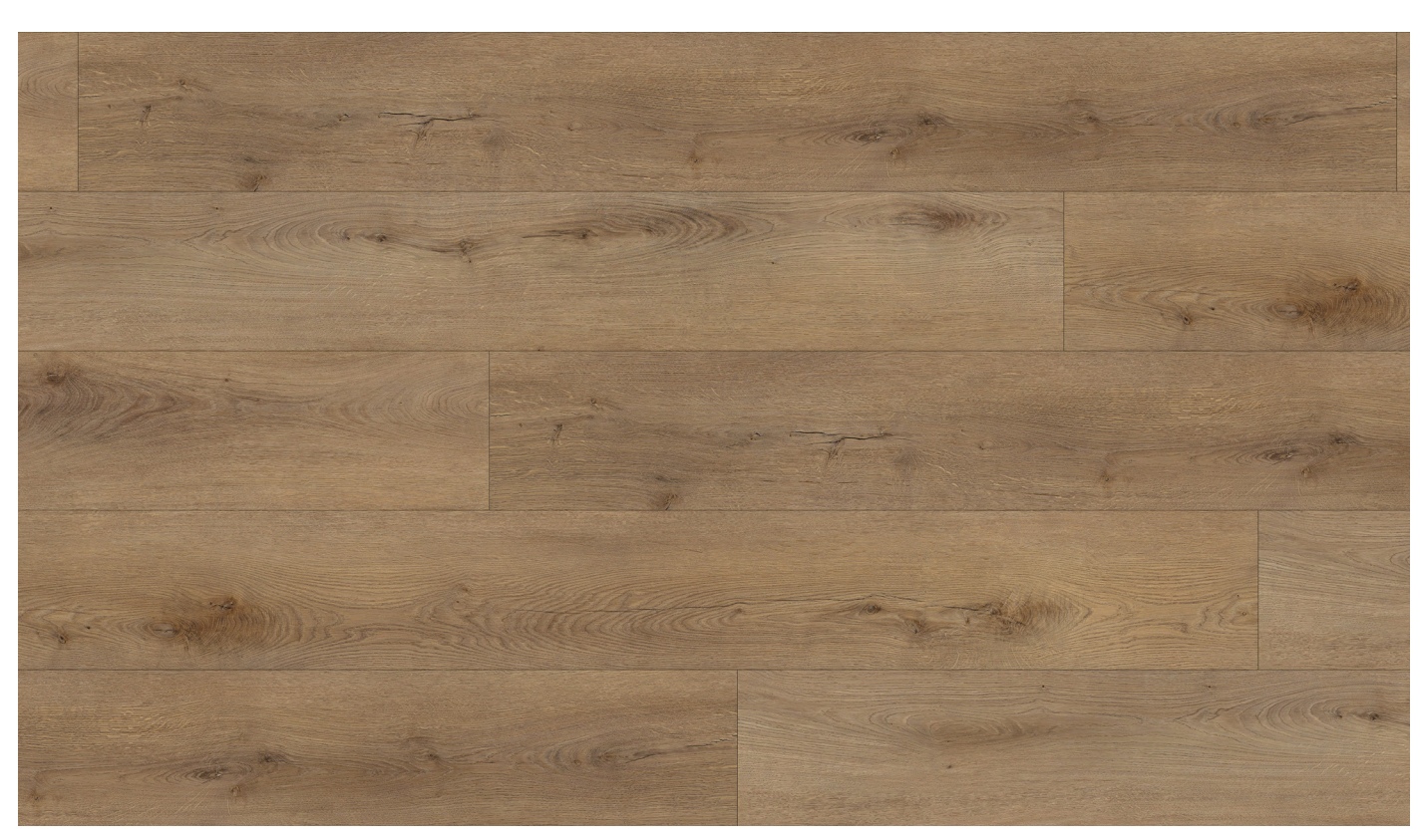
Max Floor Madera Oak 225x1800mm