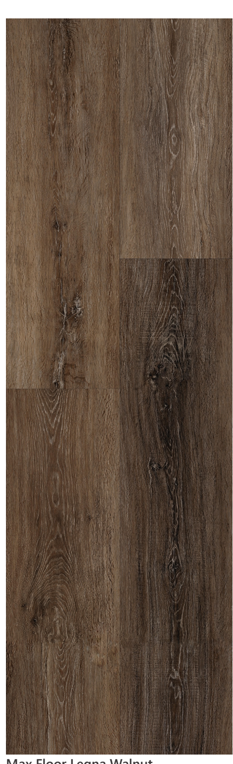
Max Floor Legna Walnut 220x1800mm