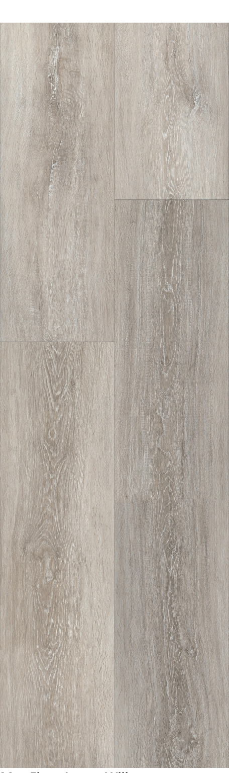
Max Floor Legna Willow 220x1800mm