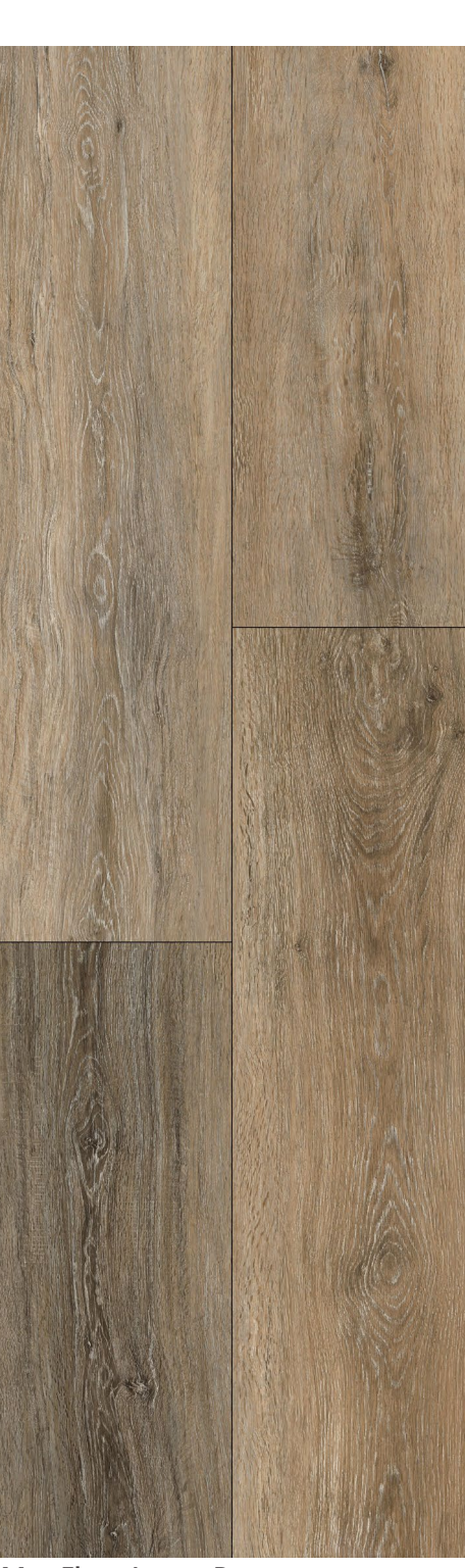
Max Floor Legna Pecan 220x1800mm