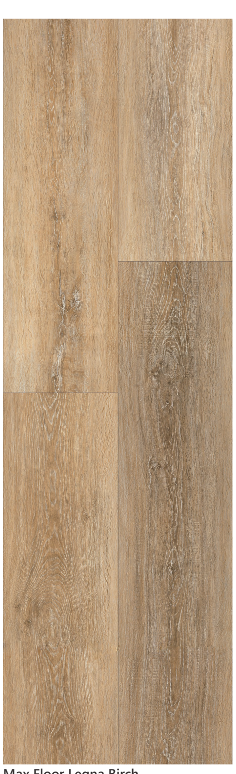
Max Floor Legna Birch 220x1800mm