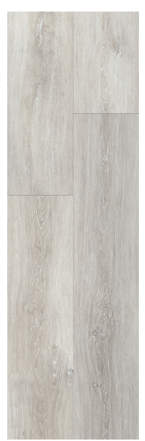
Max Floor Legna White Oak 220x1800mm