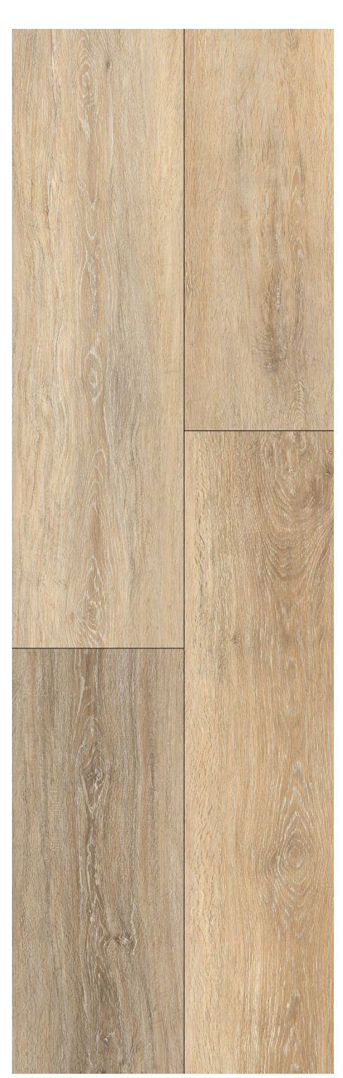
Max Floor Legna Maple 220x1800mm