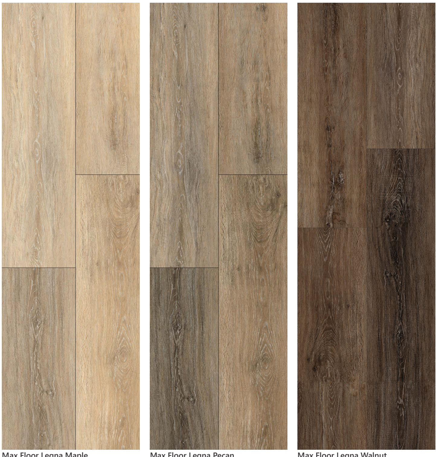
Max Floor Legna Maple 220x1800mm