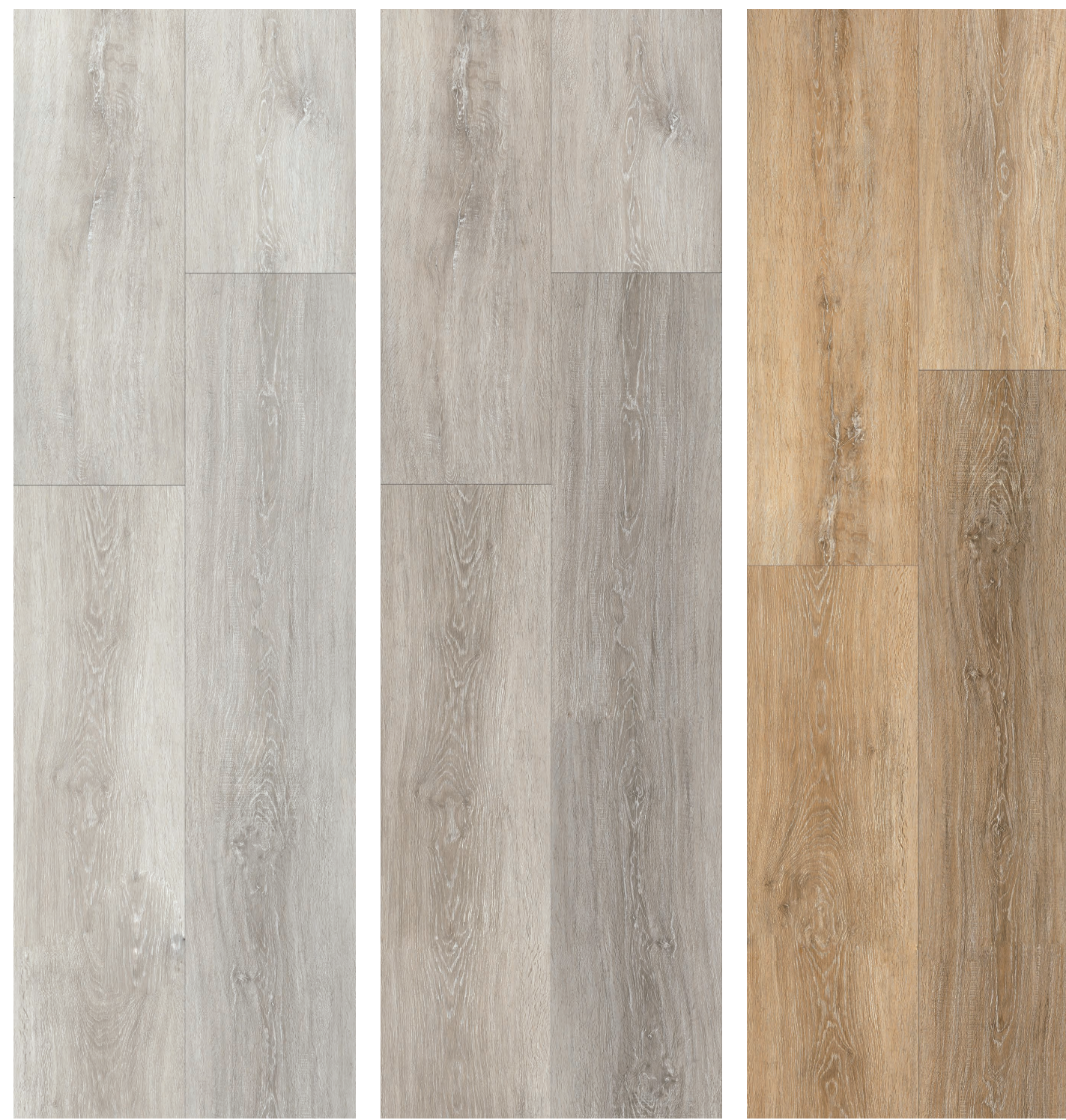
Max Floor Legna White Oak 220x1800mm