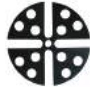
1MM RUBBER SHIM