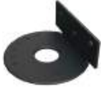
TIMBER JOIST BRACKET