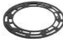
1-3 DEGREE SLOPE CORRECTOR