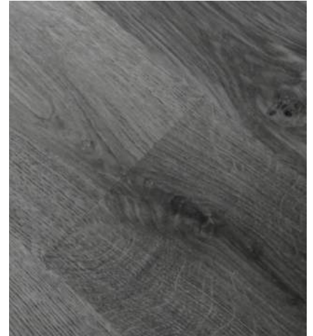
Max Floor Mountain 180x1200mm