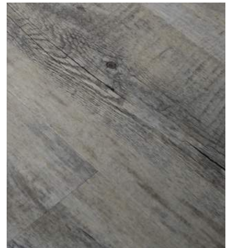
Max Floor Driftwood Grey 180x1200mm