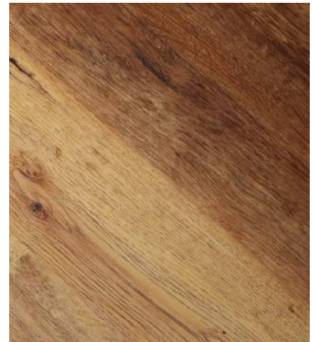
Max Floor Amazon Wood 180x1200mm