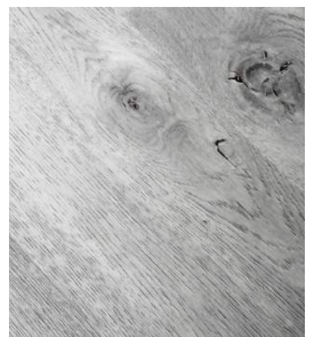
Max Floor Stonewood Grey 180x1200mm