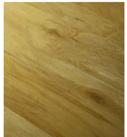
Max Floor Scandinavian Wood 180x1200mm